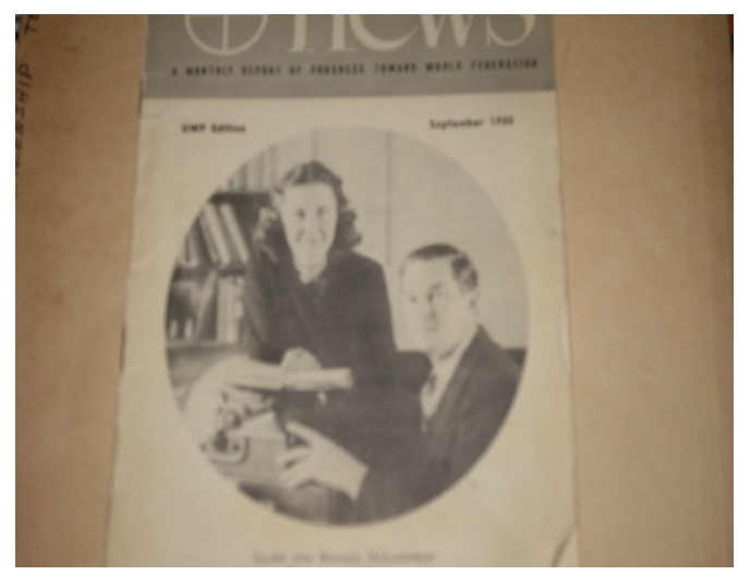
World Government News, September 1950

A narrative outline of the first twenty-five years compiled by the International Learning Alliance describes the movement's early years (1945-1972) and provides context to this less well-known period of the United Nations movement and its impact on the people in Minnesota ( Attachment B ). Stories of the pioneers in Minnesota's UN movement are revealed in this narrative. We mention two examples below: